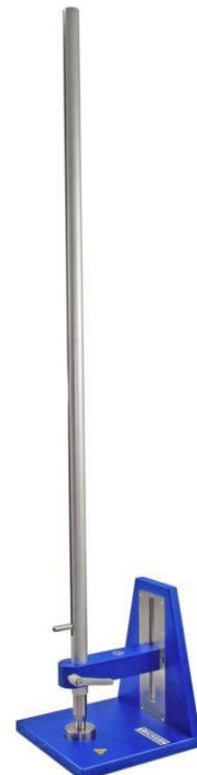
Fig. Model 304 ASTM

A fundamental point - and this applies also to the go/no-go test - is to ensure that the test is conducted at an adequate distance from the edge (at least 35 mm) and also from the previous tests on the specimen (minimum 70 mm centre to centre).