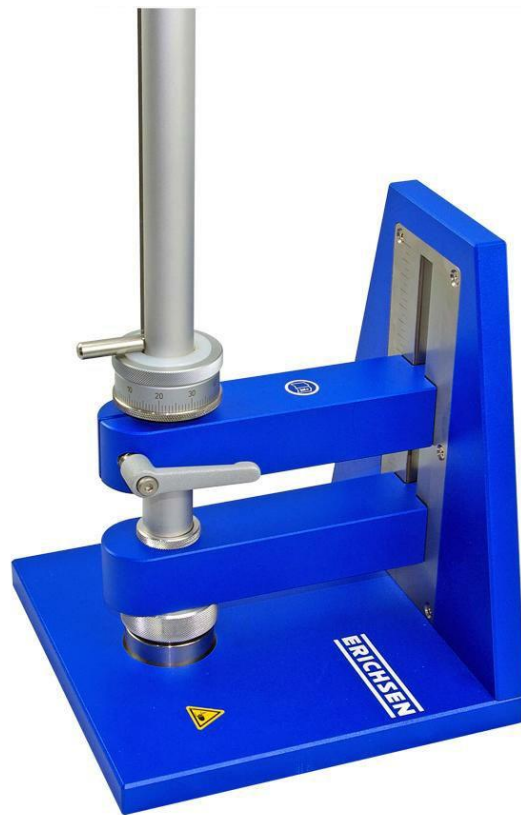
Fig. Model 304 ISO-1

Each version can be upgraded with various test sets