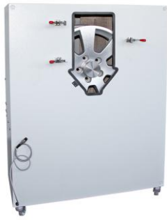
RIMpact I – Impact cabinet (for Mod. 508 SAE or VDA)