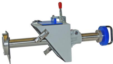
Attachment for tests in accordance with Daimler DBL 5416 (for Mod. 508 VDA)

testing equipment for quality management