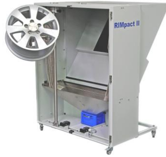
RIMpact II-VDA Impact cabinet (for Mod. 508 VDA)