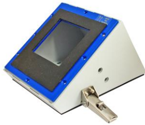
Attachment for tests in accordance with PSA D24 1312 (for Mod. 508 VDA)