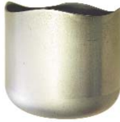
Deep Drawing Cup Test