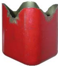
Square Cup Test