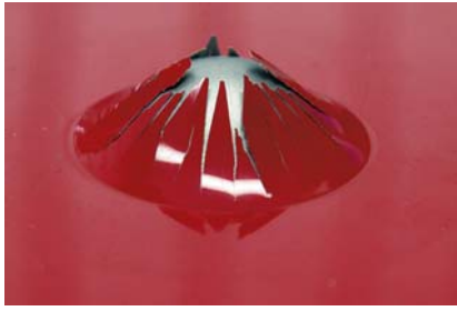
DIN EN ISO 1520